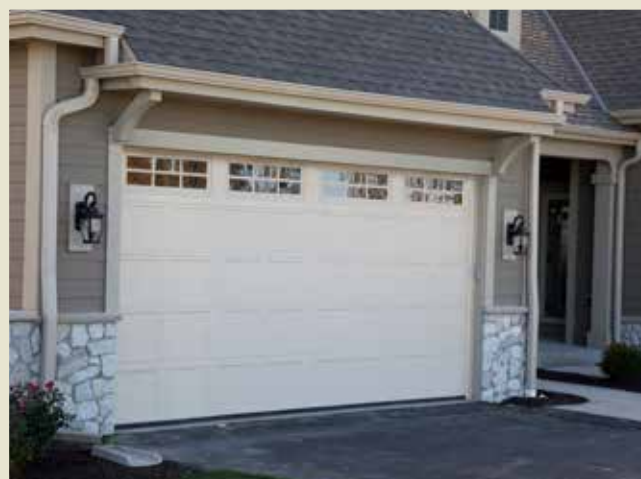
2561 in almond with 6-pane windows