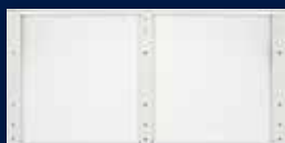
Insulated Laminate Back (L) - inside view