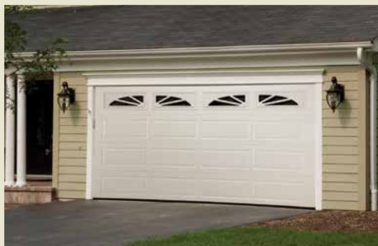
2570 in white with sunset windows