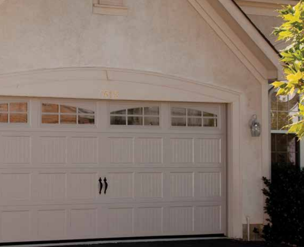
2560 in sandstone with 6-pane double arch windows