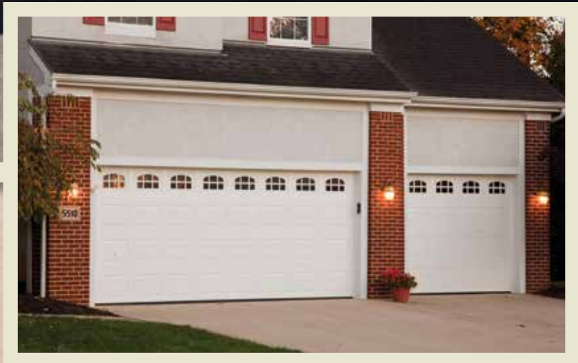
2580 in white with cascade windows