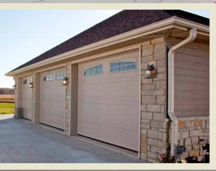
764 in sandstone with 6-pane arch windows