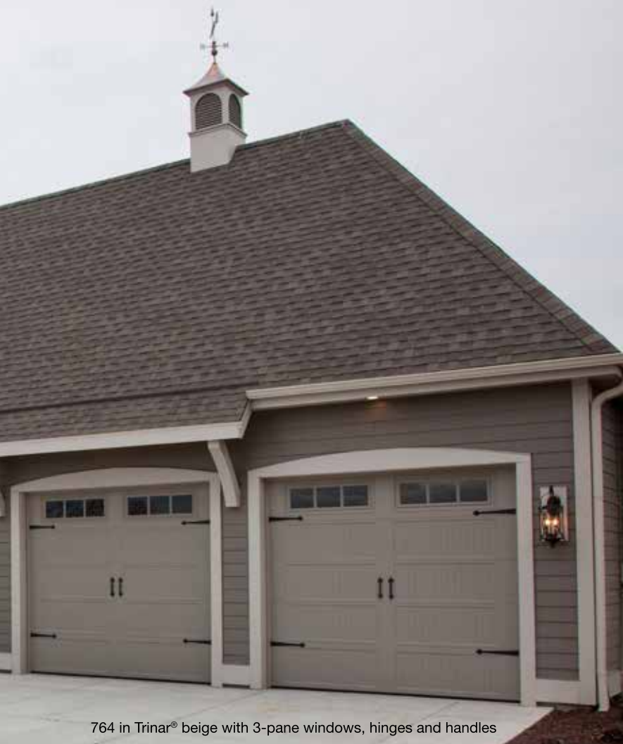
764 in Trinar® beige with 3-pane windows, hinges and handles