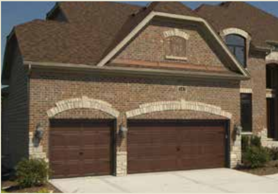
760 in american walnut, hinges and handles