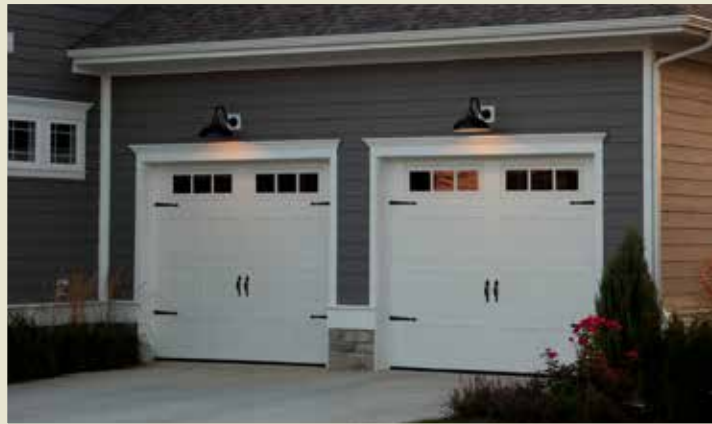
761 in white with 3-pane windows, hinges and handles