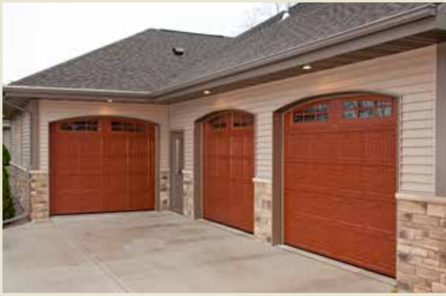
760 in mahogany with 6-pane arch windows