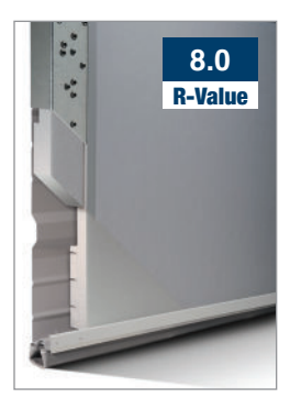
Pan Polystrene Insulation with high impact vinyl back cover