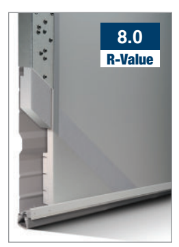
Pan Polystyrene Insulation with 27gauge steel back cover